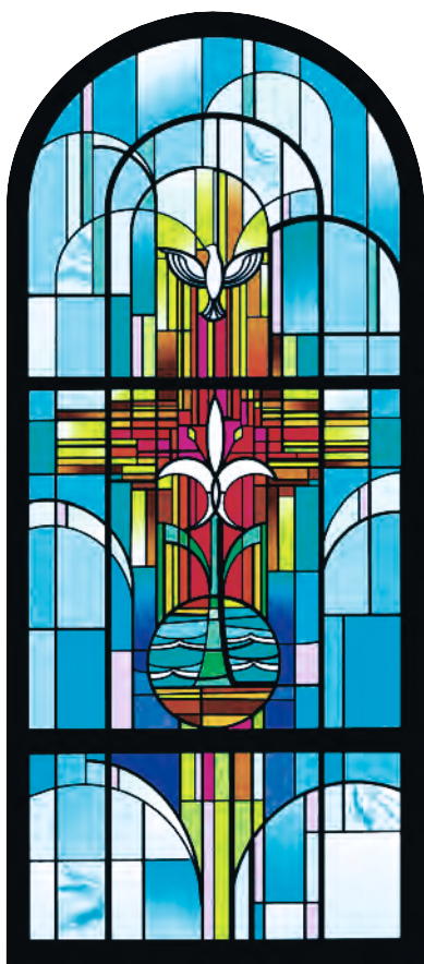
Magnificat Window—Jerry Krauski