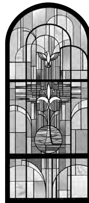
Magnificat Window — Jerry Krauski

Servite Coalition for Justice c/o Assumption Church 323 W. Illinois Street Chicago, IL 60610-4112 Ph 312-644-0036 Fax 312-644-1838