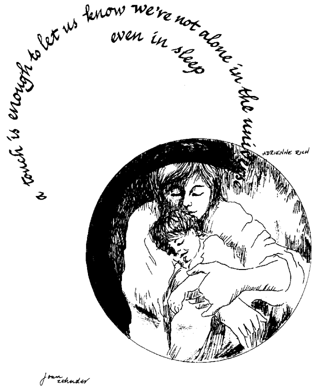
Graphic from "Woman Song II"

(All) Help us to love and respect and protect them