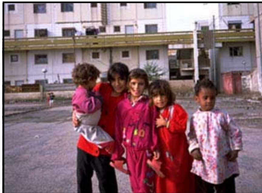
Children of Iraq

(Response) Move our hearts to find ways to relieve this suffering of your children, O God.